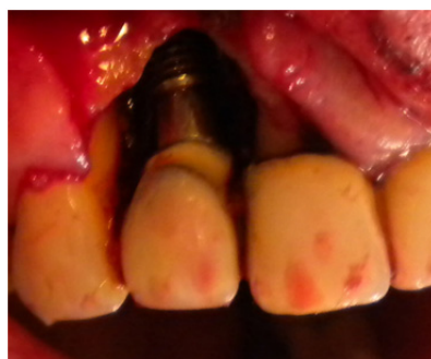
Fig. 2 Peri-implant lesion in the anterior maxillary region. A surgical procedure with a full-thickness flap was performed to expose the affected area.